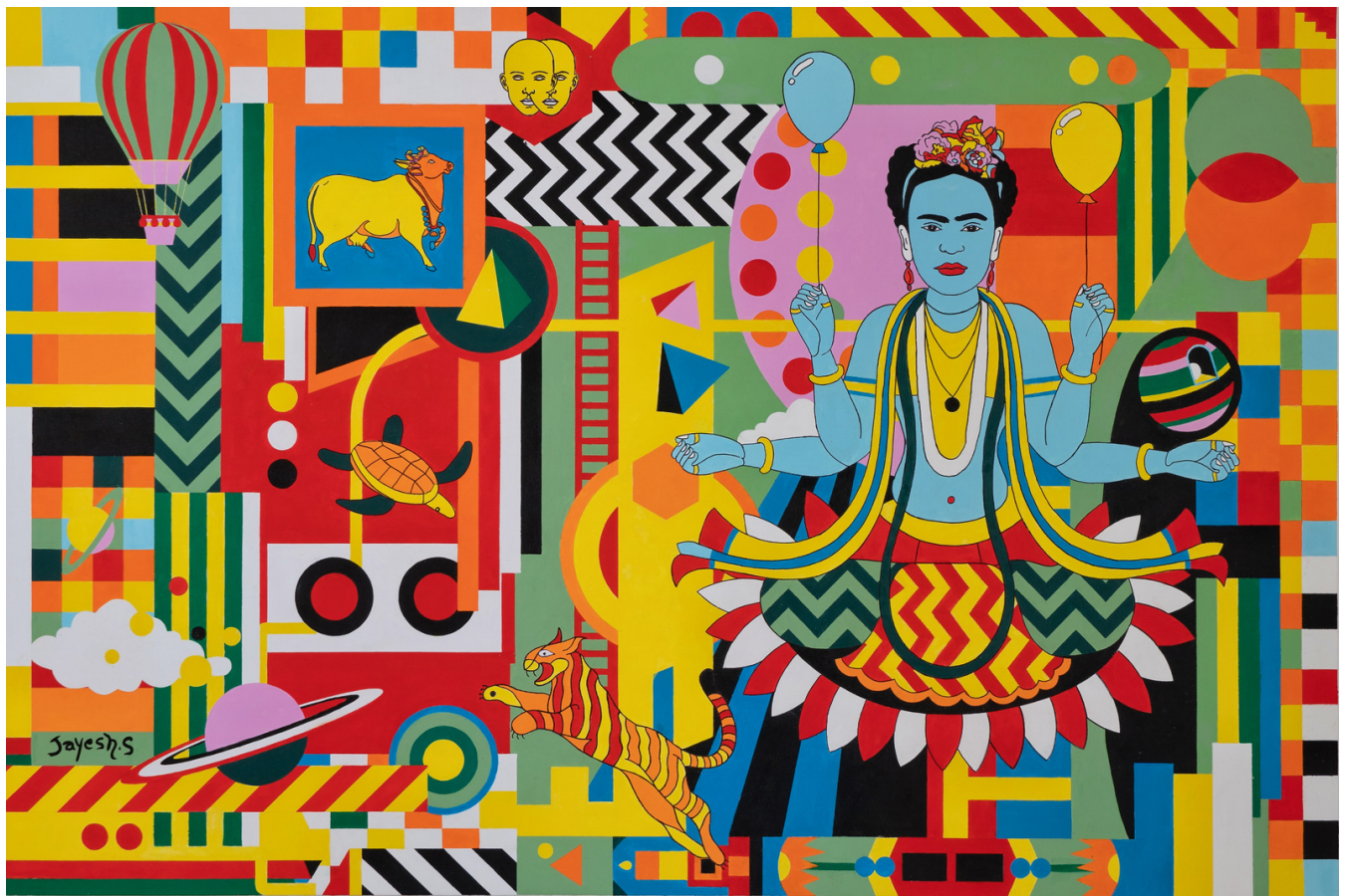
TENDERNESS OF FRIDA DEVI, 2022 ACRYLIC ON CANVAS 48 X 72 INCHES