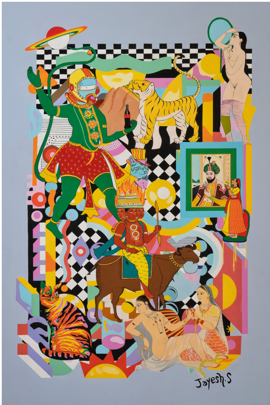
THE MUSE OF THE MYTH, 2023 ACRYLIC ON CANVAS 48 X 72 INCHES