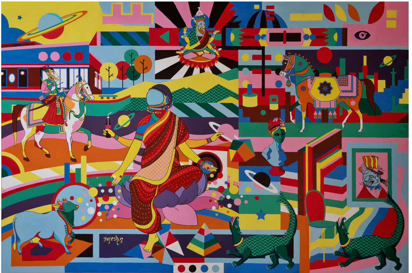
BIONIC GODDESS, 2022 ACRYLIC ON CANVAS 48 X 72 INCHES