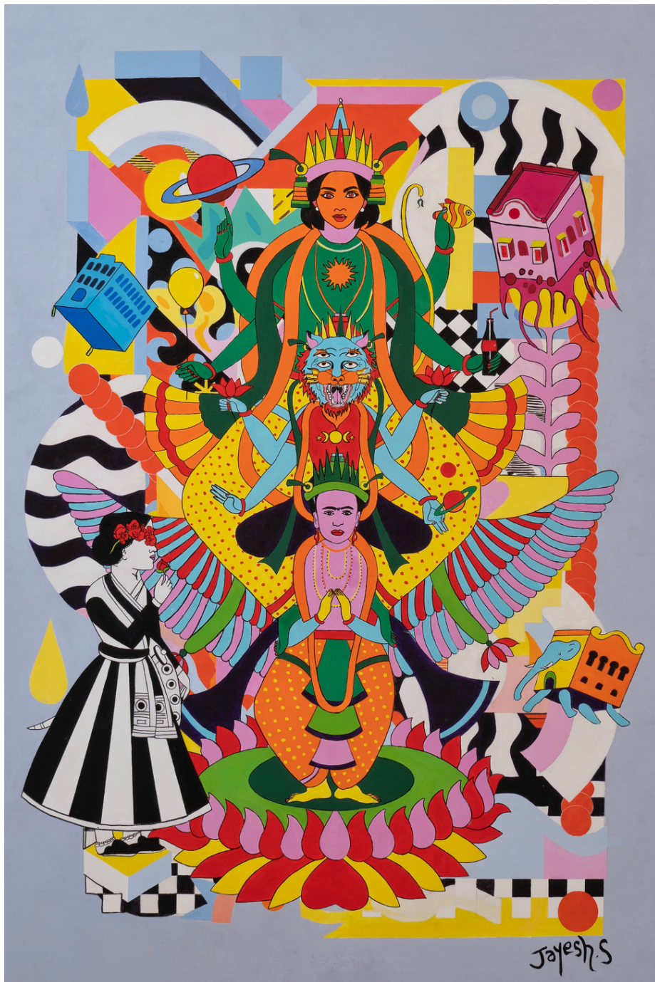
CREATE PRESERVE DESTROY, 2023 ACRYLIC ON CANVAS 48 X 72 INCHES