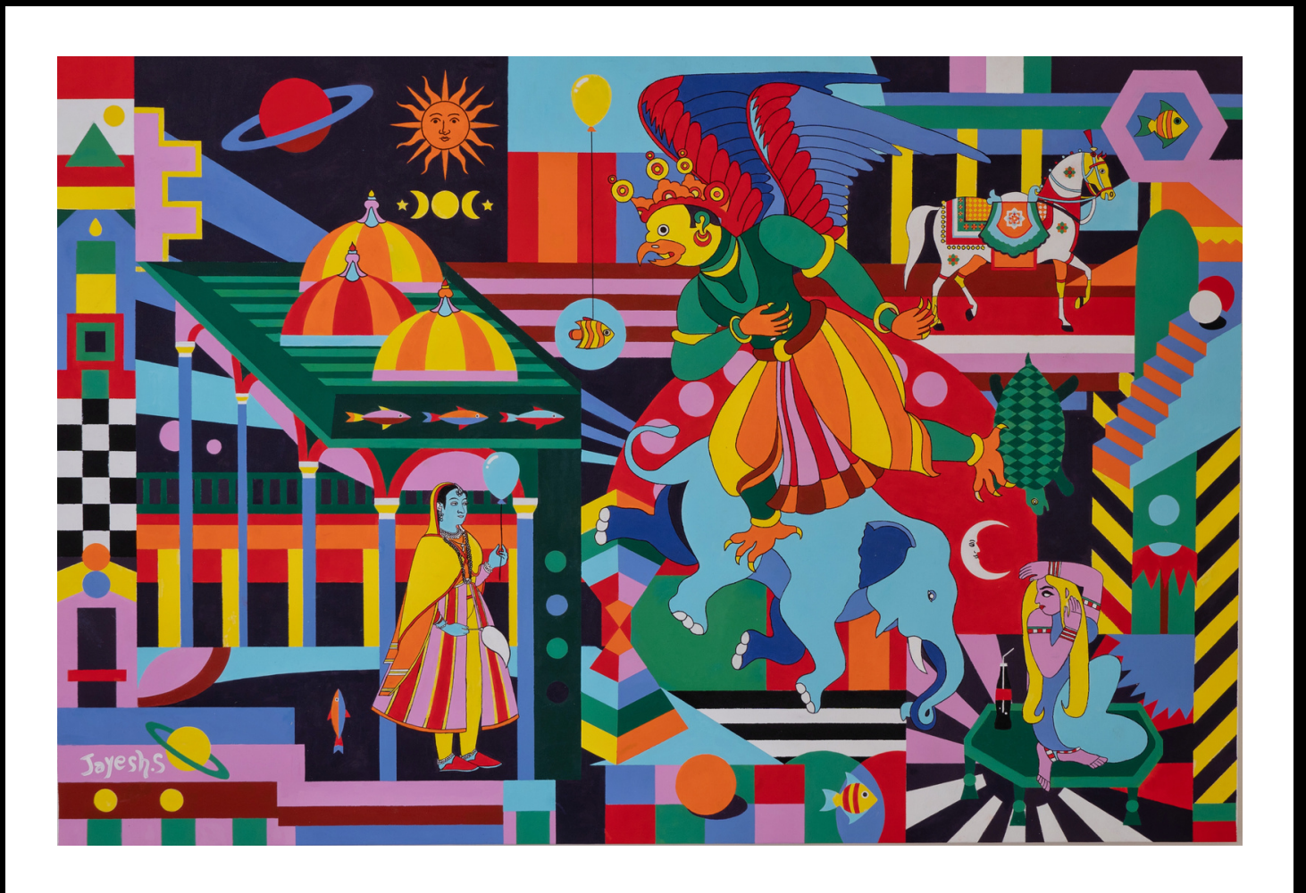
TIME TRAVELLING KIT, 2022 ACRYLIC ON CANVAS 48 X 72 INCHES