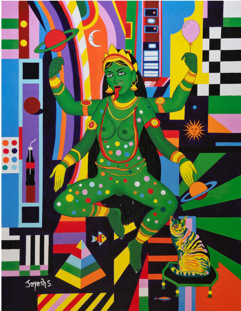
KITTEN COSMOS, 2023 ACRYLIC ON CANVAS 51 X 39 INCHES