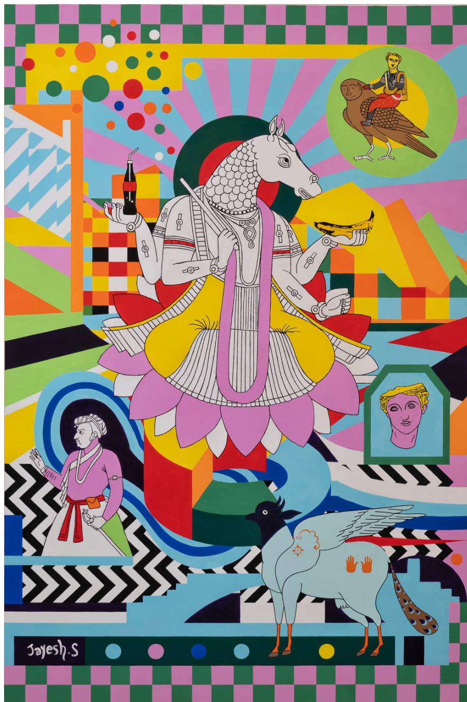
GREAT WHITE DEMI GOD, 2022 ACRYLIC ON CANVAS 48 X 72 INCHES