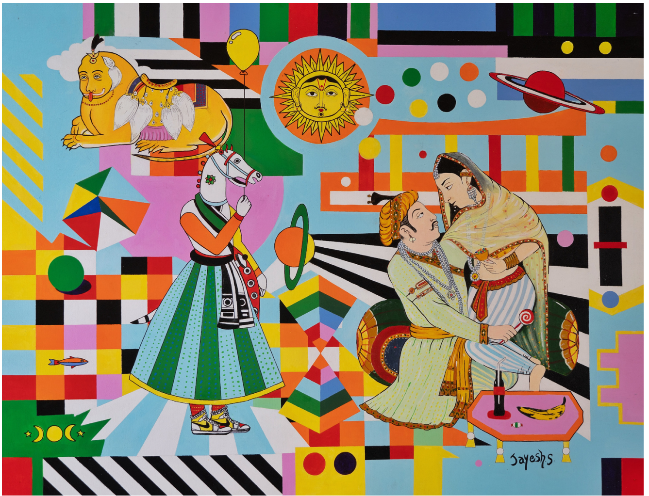
LIMBIC RESONANCE, 2023 ACRYLIC ON CANVAS 39 X 51 INCHES