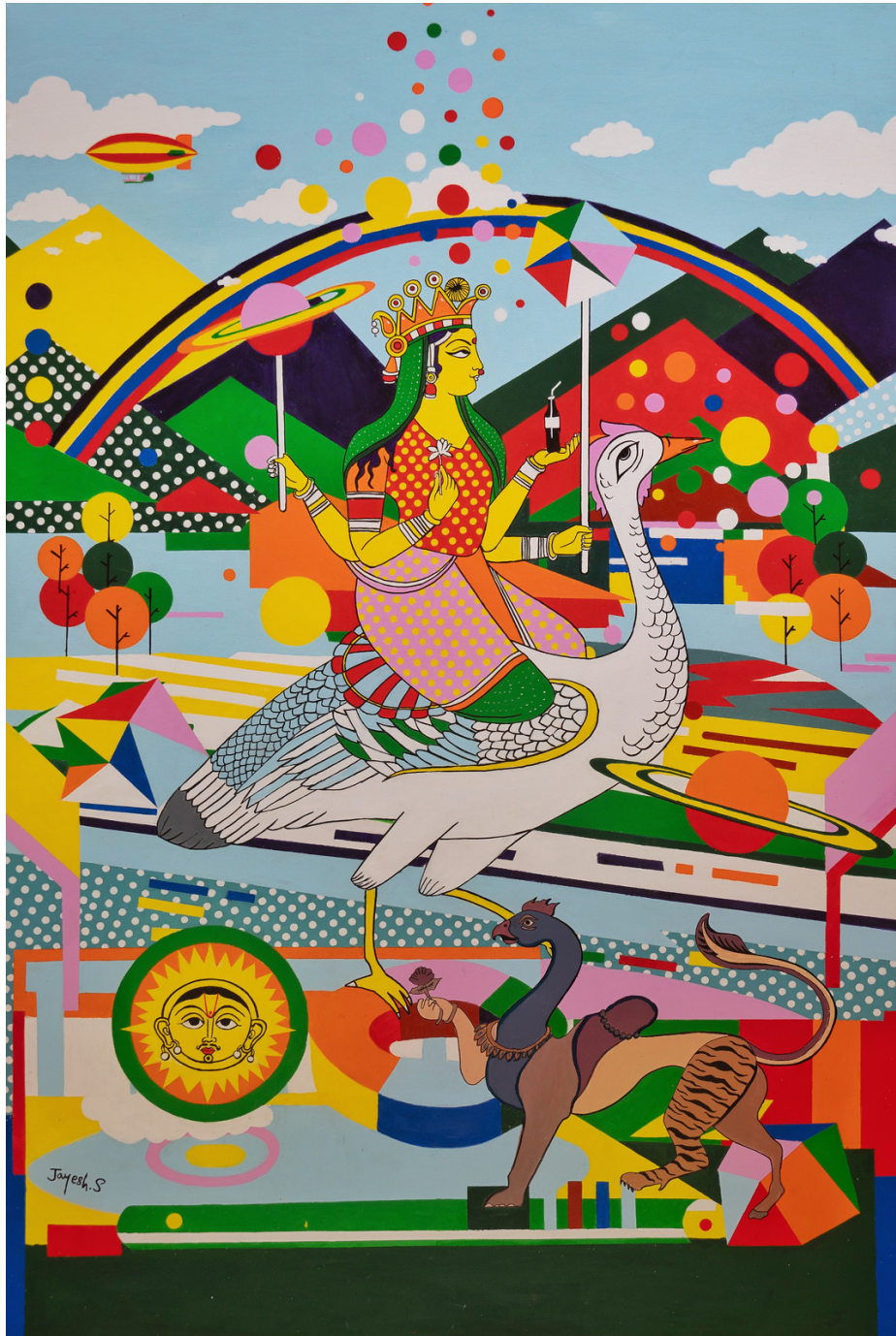
CONSORT OF CREATION, 2022 ACRYLIC ON CANVAS 48 X 72 INCHES