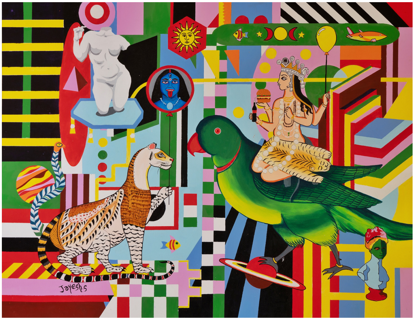
CUPID'S REALM, 2023 ACRYLIC ON CANVAS 39 X 51 INCHES